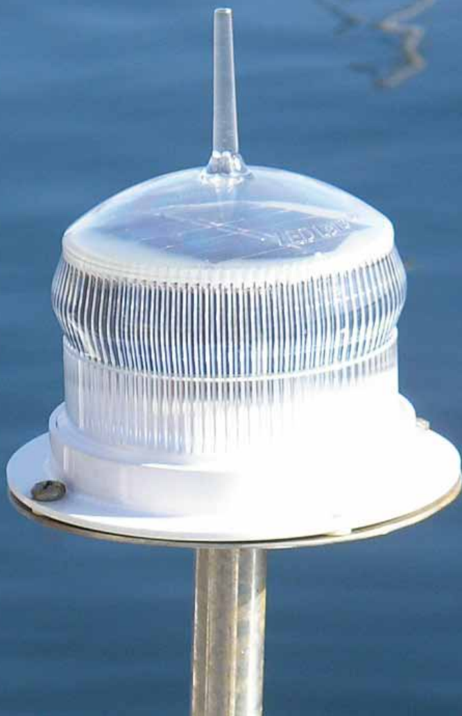
SL15 solar marine lantern Vigo, Spain